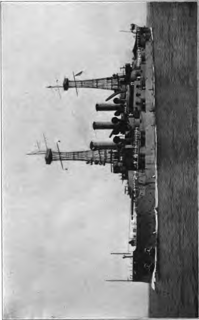
U.S.S. CONNECTICUT, 1911